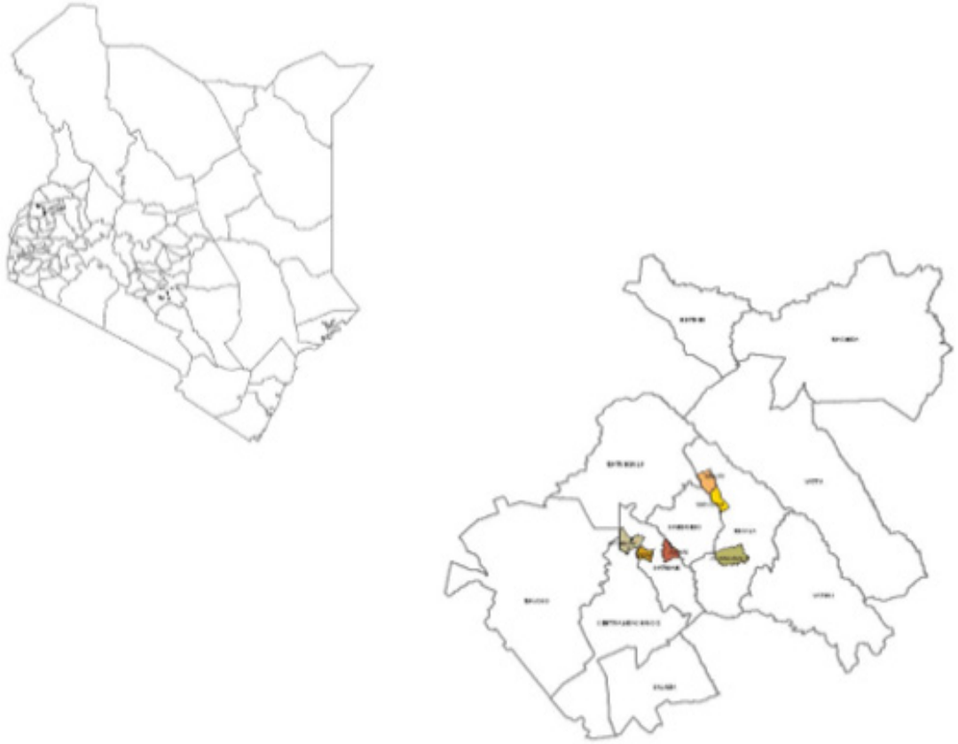
Figure 1: Map showing Machakos County study sites