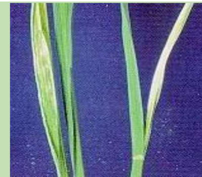
Fig 2. Wilting leaf tips