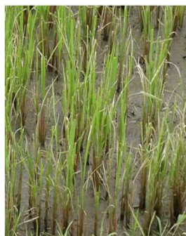
Fig 2, Ladder like appearance on damaged rice (IRRI Rice Knowledge bank)