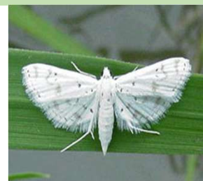
Fig 3. Rice caseworm moth (IRRI Rice Knowledge bank)