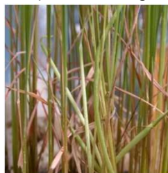
Fig 3. Onion shaped Galls on rice shoot