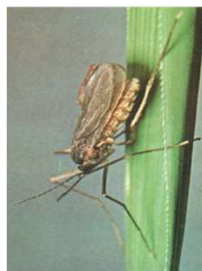
Fig 1. Adult midge on a leaf