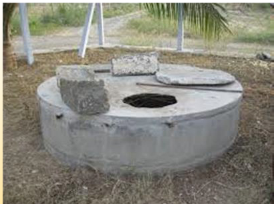
Waste disposal pit

Expired and unused veterinary medicines should be carefully disposed of to avoid contamination of the environment and minimize risks to animal and human health as a result of exposure. Some of the recommended ways of disposing of veterinary medicines include incineration and dumping in recommended waste disposal facilities