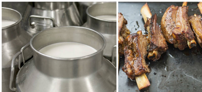
Milk and meat: Animal products prone to drug residues