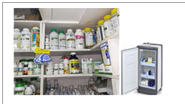
Recommended storage for veterinary medicines

temperatures. Products kept in refrigerators should be checked frequently and maximum and minimum temperatures recorded daily.