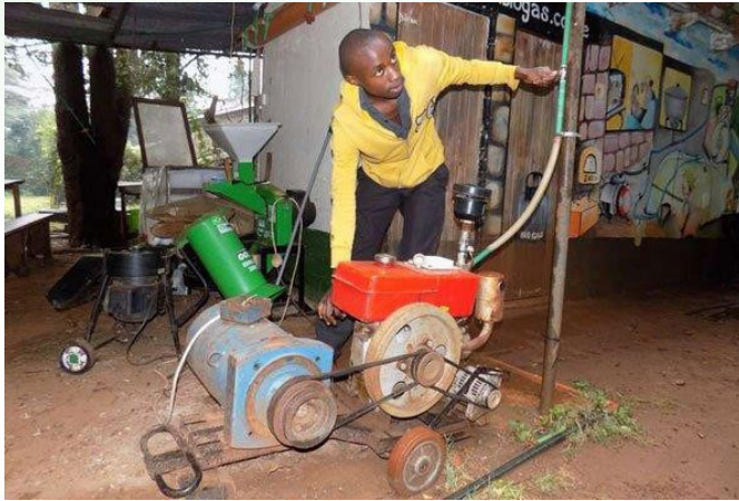
Biogas for electricity