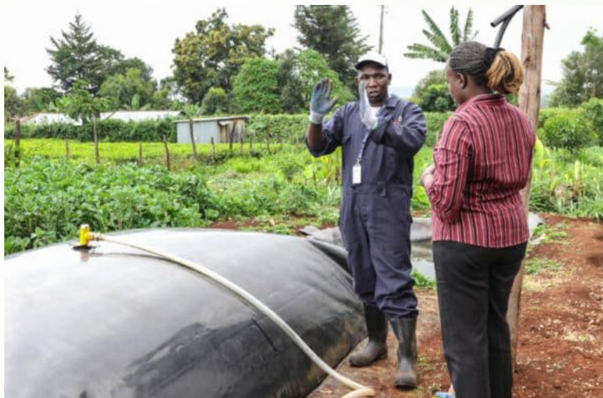
Balloon biogas plant