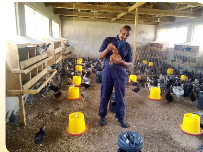
Demonstration is a communication means through action, showing how the practice is performed.

Use of demonstration as a means of communication in Indigenous chicken