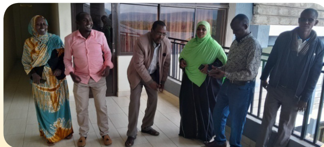
Song demonstration in a group dynamics

In a group dynamic song, the group illustrates through a song demonstrating how the community celebrate after a bumper harvest. This communicates the effect of an effective communication.