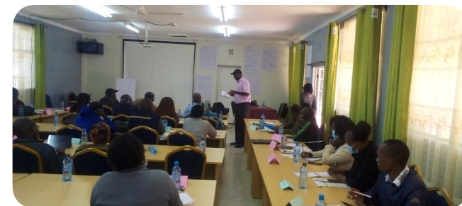
In a lecture, the facilitators give information to participants verbally, as a means of communication

Use of demonstration as a means of communication in Indigenous chicken