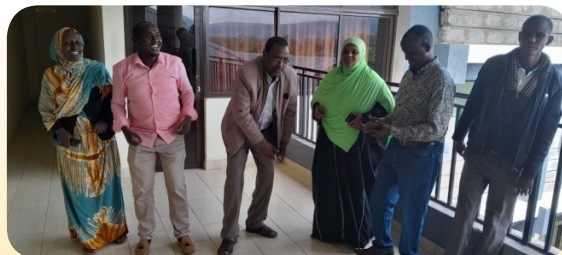
Song as a group dynamic

In the picture above the group is demonstrating in a song, how the community celebrates after a bumper harvest. This communicates the effect of an effective communication.