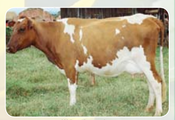
Well supplemented cow