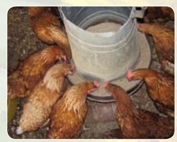
Layers feeding on ration