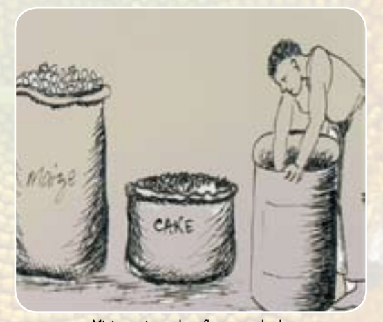
Mixing maize and sunflower seed cake

Mix 18 kg of sunflower cake with 100 kg of maize germ to make dairy meal.