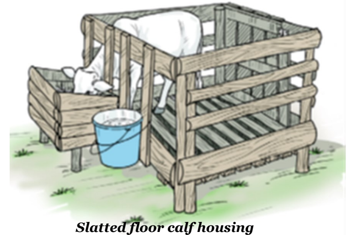
Slatted floor calf housing

A good calf house should be well ventilated, easy to clean and made of locally available material.