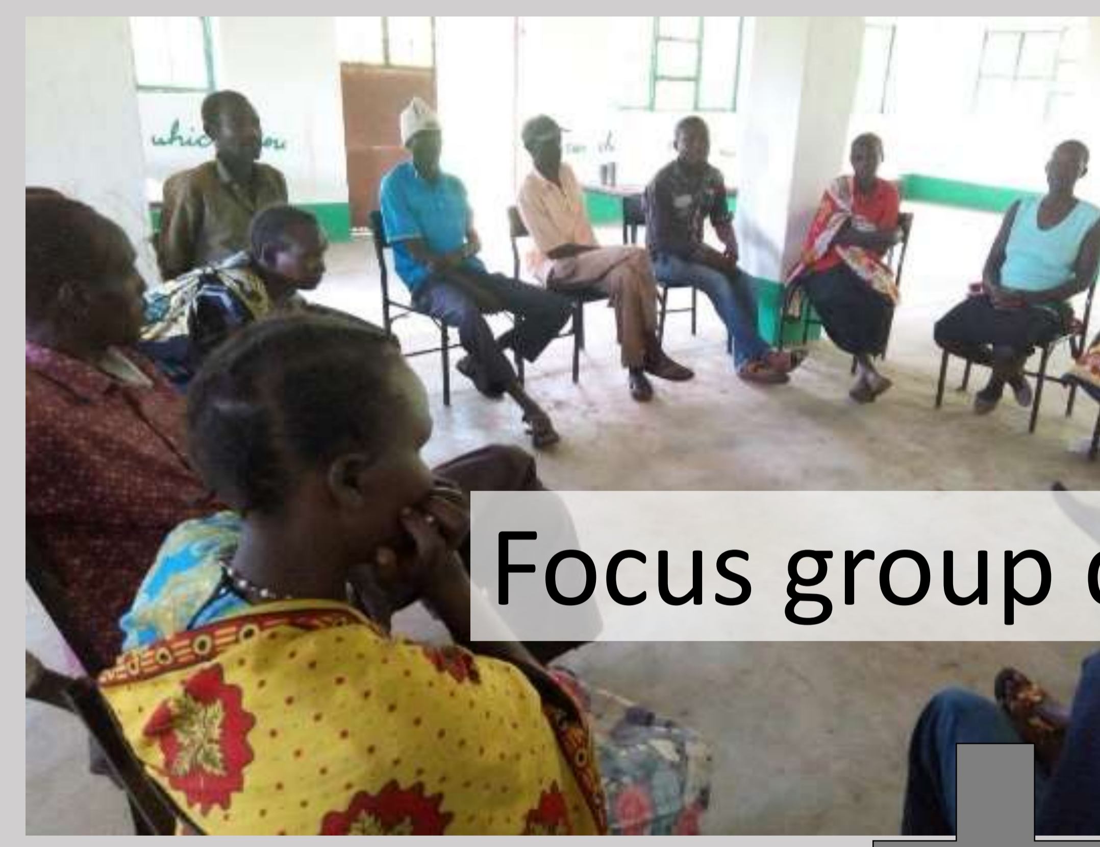
Focus group discussions