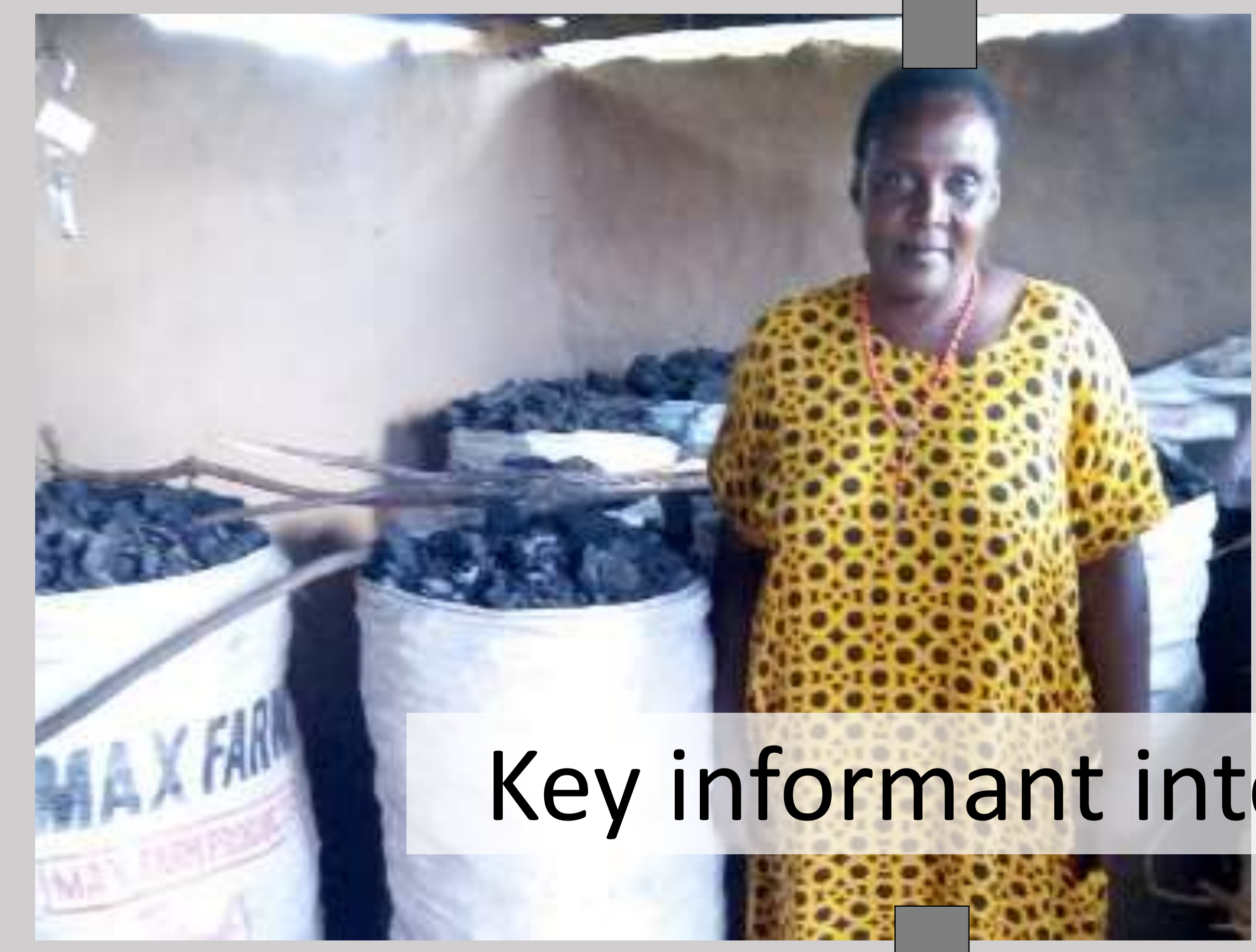
Key informant interviews