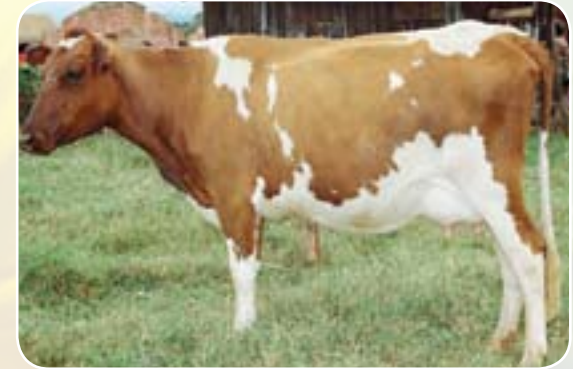
Well supplemented cow