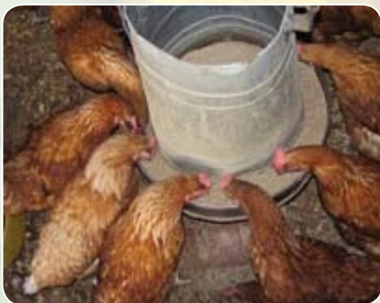
Layers feeding on ration

The layers' ration should include oyster shell at 2-3 kg for every 100 kg prepared.