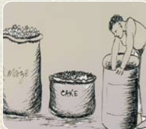
Mixing maize and sunflower seed cake