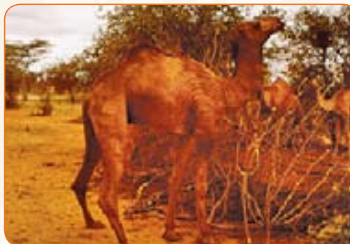
Young bull showing rutting behavior