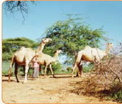
Replacing bulls for upgrading