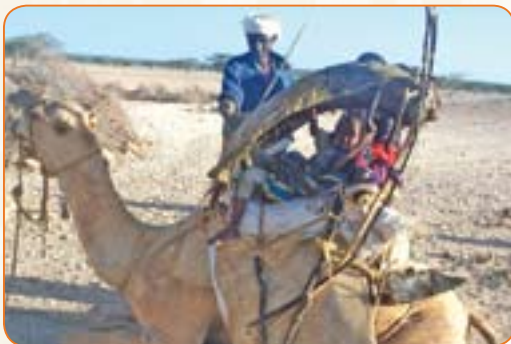
Old bulls used for loading