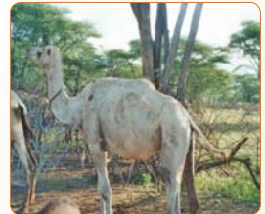
Old retired female for culling

Beyond sixth calving, there is an increase in calf mortality and poor conception rates.