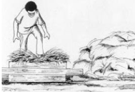
5. Pack the dried grass tightly in the box.