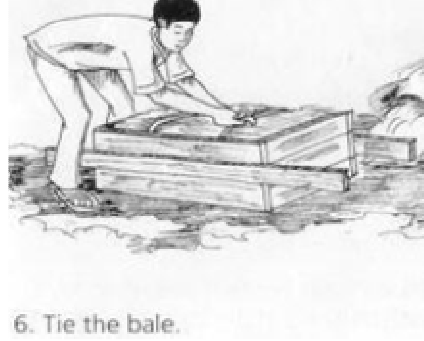
6. Tie the bale.